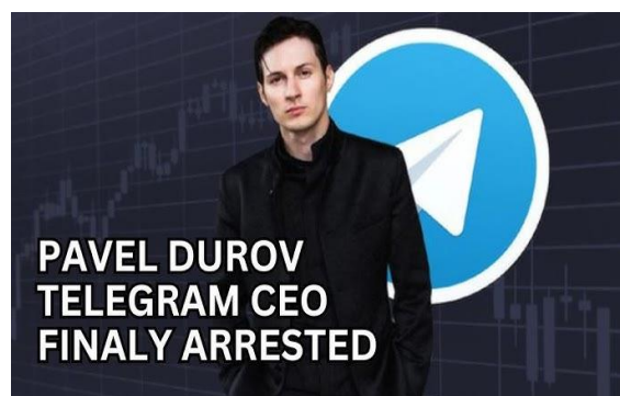
PAVEL DUROV TELEGRAM CEO FINALLY ARRESTED