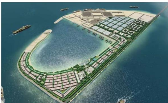
India, Maldives Launch Major Infrastructure Projects