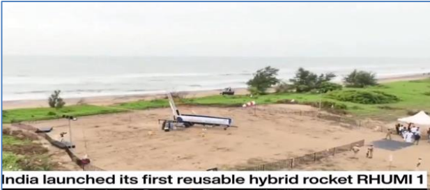
India launched its first reusable hybrid rocket RHUMI 1

India's first reusable hybrid rocket Rhumi-1 was launched from Chennai by Space Zone India in collaboration with Martin Group.