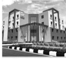
वाराणसी में बनने वाले देश के पहले हिंदी साहित्य के भाषा संग्रहालय की डिजाइन • राज्य हिंदी संस्थान

Books, photographs, rare manuscripts, documents etc. of famous Hindi litterateurs will be preserved in it.