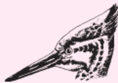
To make holes in wood and tree trunks