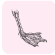
To swim in water