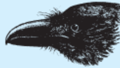
To cut and eat many kinds of food