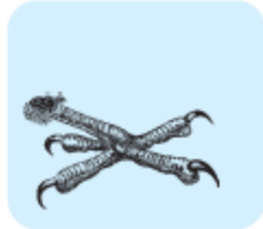
To climb the tree