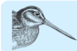
To find insects and worms from mud and shallow water