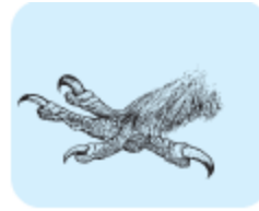
To catch the prey (what it hunts)