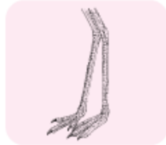
To walk on the land