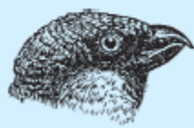
To break and crush seeds