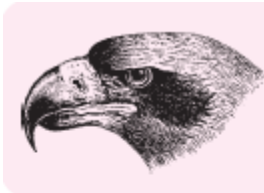
To tear and eat meat