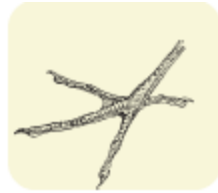
To hold the tree branches