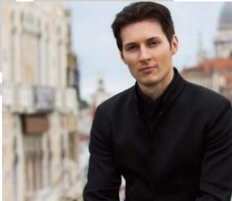
'Russia's Mark Zuckerberg