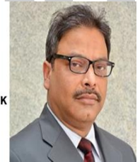
राष्ट्रीय आवास बैंक NATIONAL HOUSING BANK